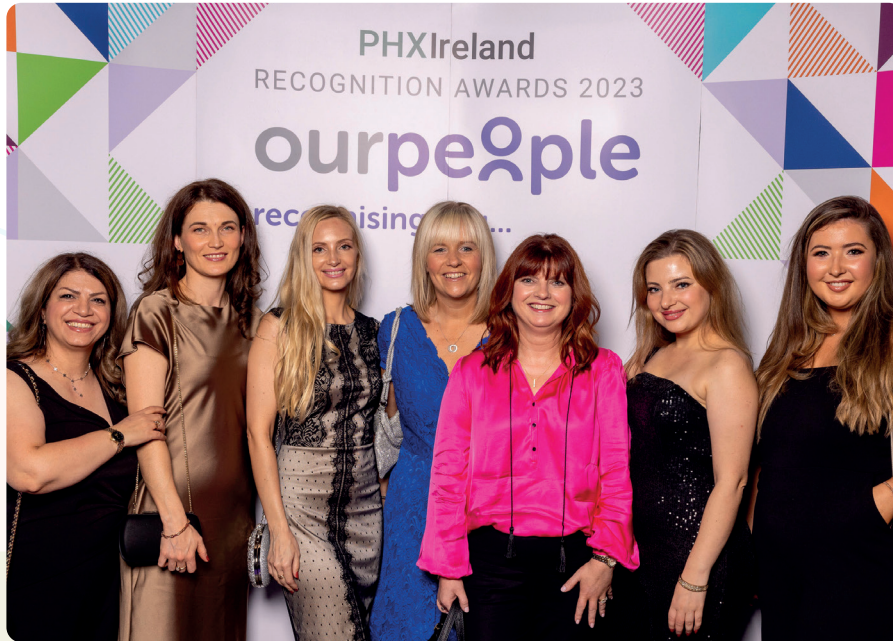
Recognition Awards 2023